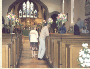
ABOVE: In 1980 the front pews where removed and replaced with chairs. This picture shows the rear pews which were removed in 1989