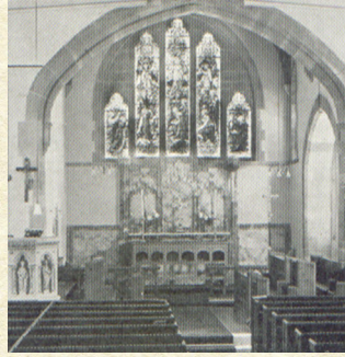
ABOVE: Interior of St Michaels in 1939

2011 Work carried out on Church Tower, which included a new roof and addition of a flag pole.